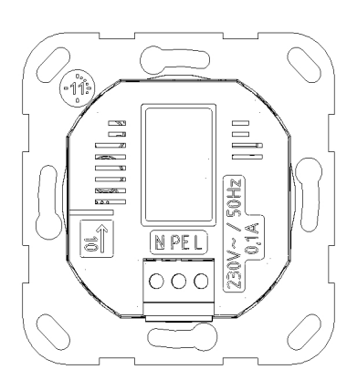
Fig. 2: Rear of network connection box

Arrow and 'TOP' point upwards, see figure 1, network connection box